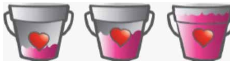
Near Empty Bucket 30% Engagement

What in the world is that, you say? The Love Bucket is an easy way to visualise how effective you are being in motivating and engaging your staff.